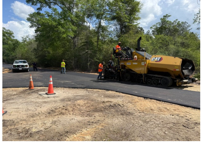
Contractor Paving Road near STA 102+00 on Thomas St.