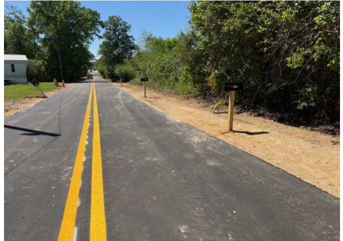
Preliminary Striping and Markers With Mailboxes near STA 108+00 on Thomas St.