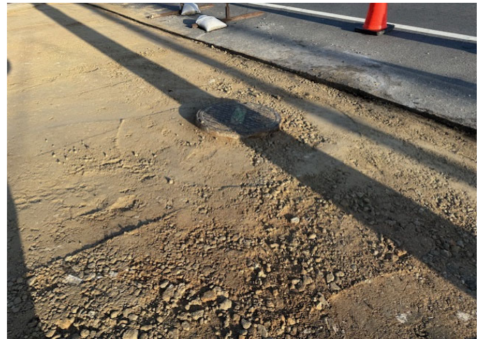
Adjusted Manhole near STA 2+00 on Magnolia St.