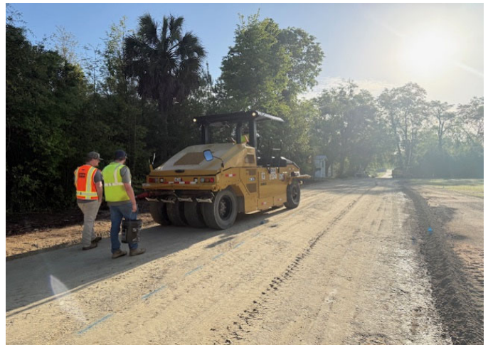
Proof Rolling Roads Before Paving near STA 109+00 on Thomas St.