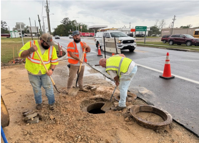
Contractor Adjusting Manhole near STA 2+00 on Magnolia St.