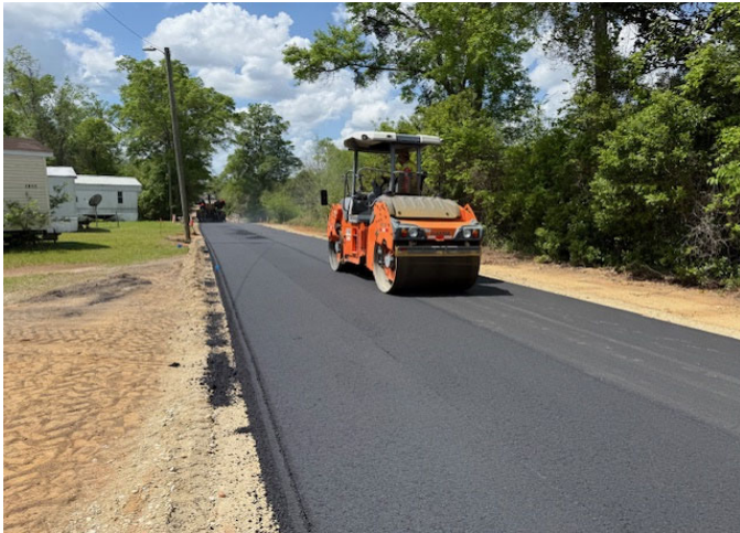
Contractor Compacting Asphalt near STA 109+00 on Thomas St.