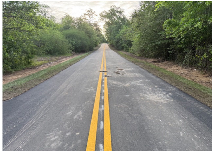
Preliminary Striping and Markers With Sod near STA 103+00 on Thomas St.