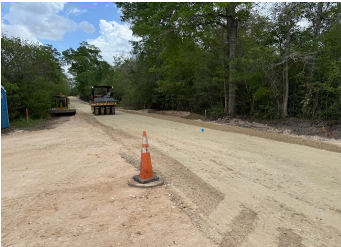
Contractor Comapcting Base near STA 103+00 on Thomas St.