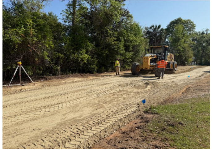
Contractor Setting Final Grade near STA 107+00 on Thomas St.