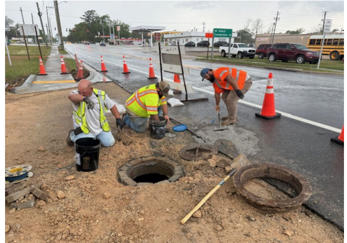
Contractor Adjusting Manhole near STA 2+00 on Magnolia St.