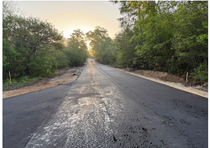
Contractor Finished Paving Roads near STA 102+00 on Thomas St.