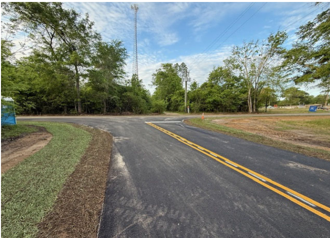
Preliminary Striping and Markers With Sod near STA 1+50 on Magnolia St.