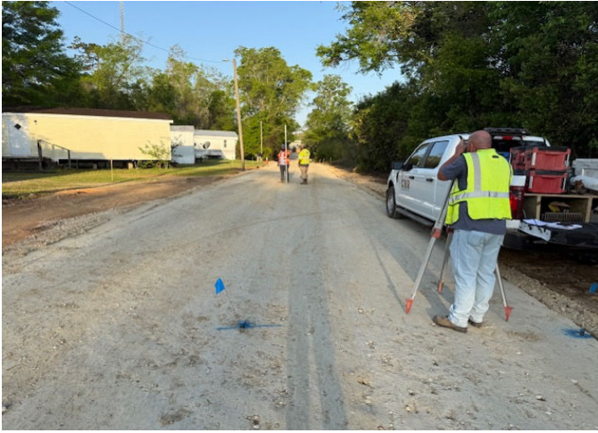
Contractor Checking Final Grade near STA 109+00 on Thomas St.