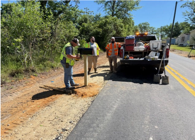
Contractor Installing Mailbox near STA 107+50 on Thomas St.