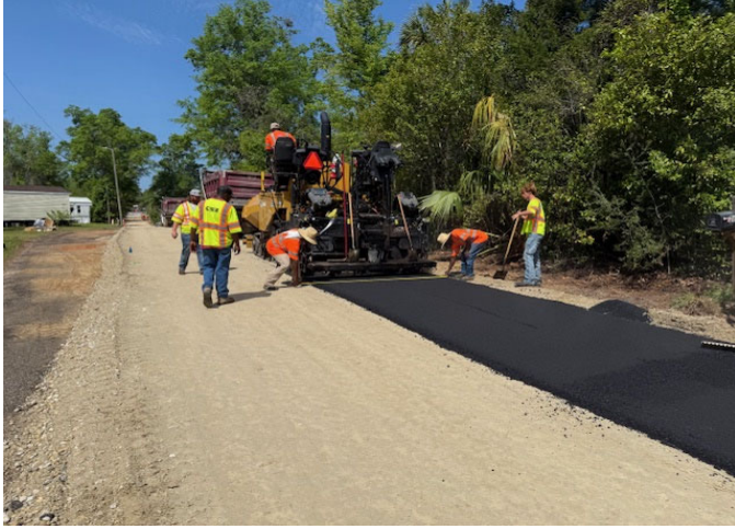
Contractor Checking Road Width During Paving near STA 109+50 on Thomas St.